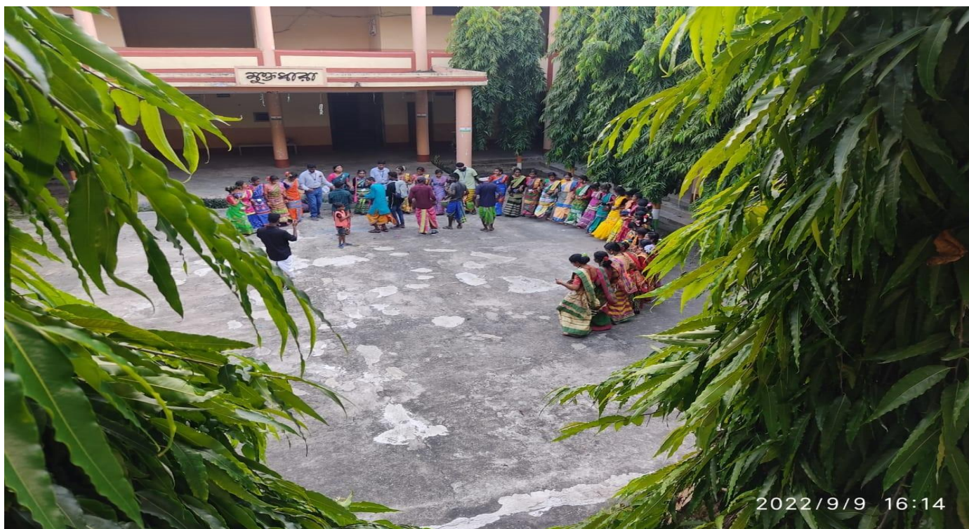
Santali Traditional Dance by Our Student