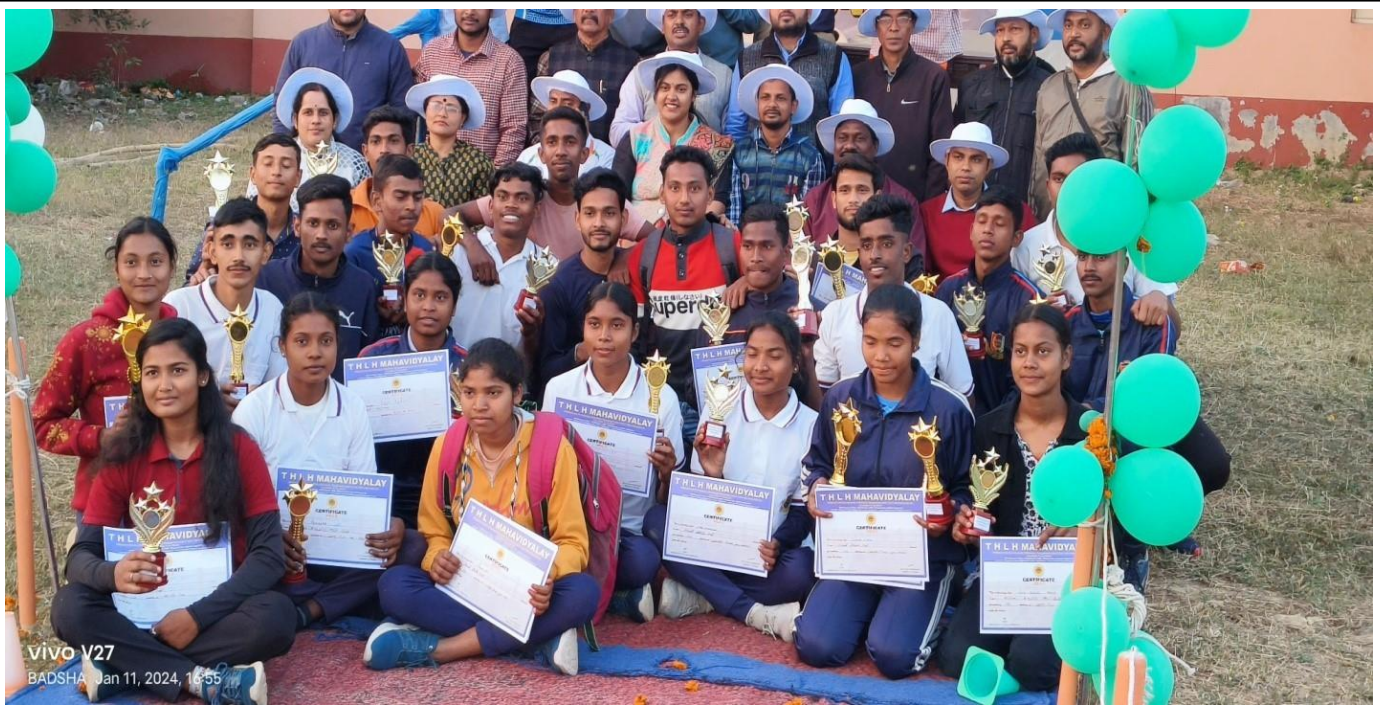
Participation in COLLEGE SPORTS